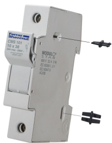
CMS810PAK + fuse-holder